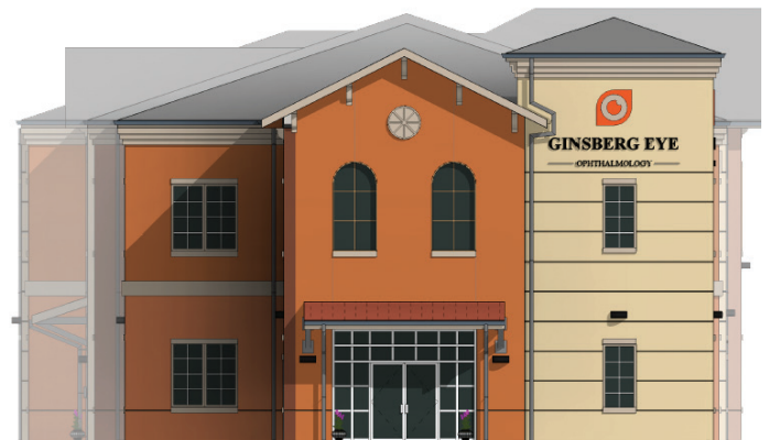
Building representation only, subject to change