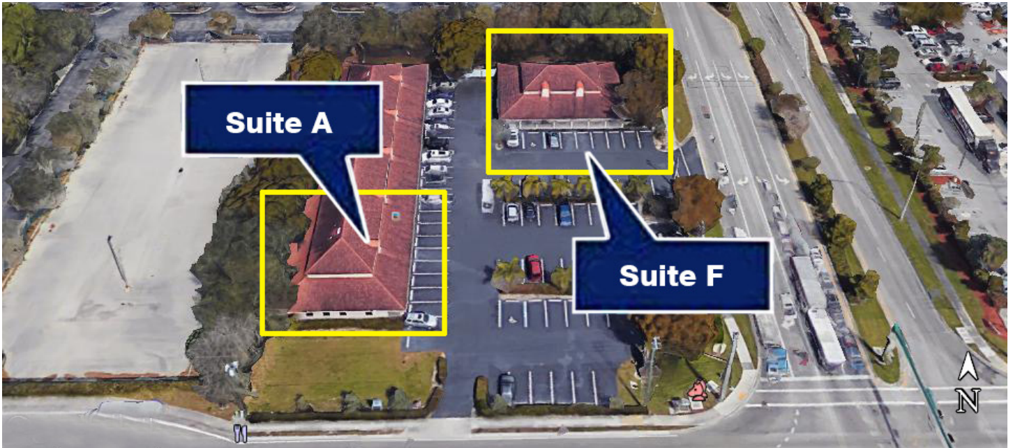
2171 Pine Ridge Rd Suite A